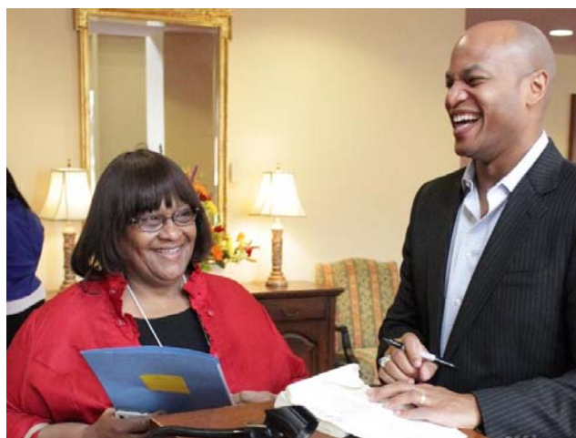
Summit participants enjoyed Wes Moore

Many thanks to the over 200 professionals and students who participated in the Mississippi KIDS COUNT Sixth Annual Summit in Jackson on February 22nd!